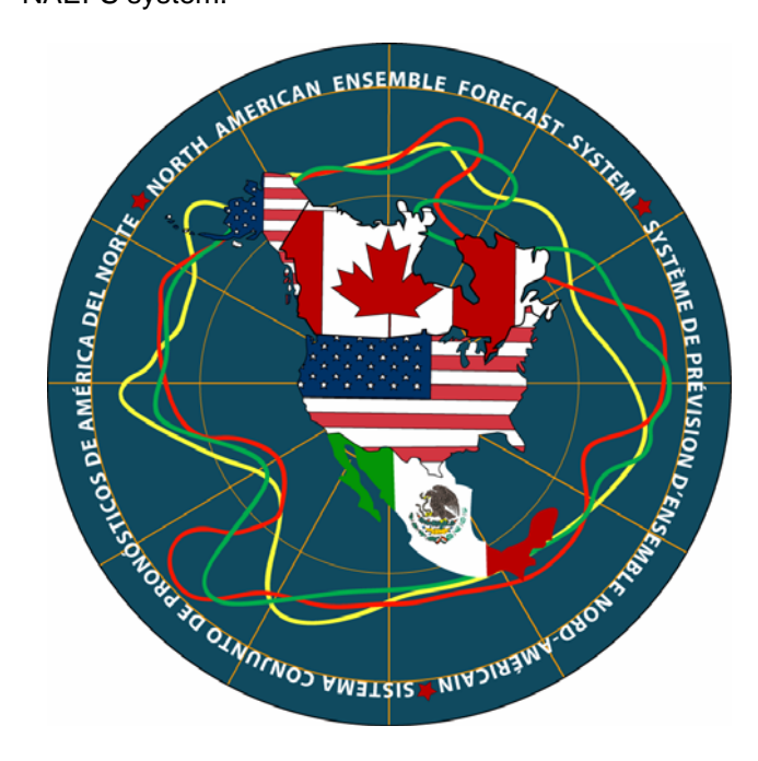
Fig. 1. A graphical depiction of the North American Ensemble Forecast System.

the private sector and for the general public in Canada and the other countries. All three participating weather services are expected to contribute to the design of these products, and will naturally benefit in their daily routine work from the operational generation of these products by the NAEFS system.